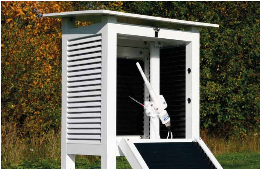
HMP155 with an additional temperature probe and optional Stevenson screen installation kit.

The Vaisala HUMICAP® Humidity and Temperature Probe HMP155 provides reliable humidity and temperature measurement. It is designed especially for demanding outdoor applications.